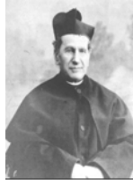
St. John Bosco 1815-1888 "Apostle of Youth" Founder of the Salesian Society and of the Daughters of Mary, Help of Christians Memorial - 31 January

...John (St. John Bosco) opened the Oratory of St. Francis de Sales for boys. Several wealthy and powerful patrons contributed money, enabling him to provide two workshops for the boys, shoemaking and tailoring. Because John realized the importance of job-training and the self-worth and pride that come with talent and ability, he trained his students in the trade crafts.